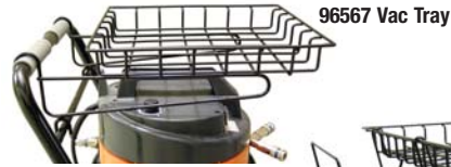
96567 Vac Tray