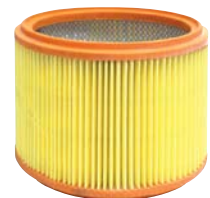
64684 H.E.P.A. Filter