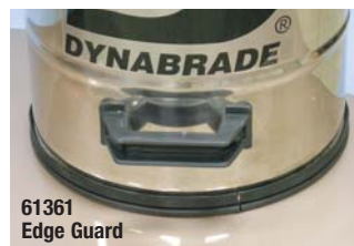
61361 Edge Guard