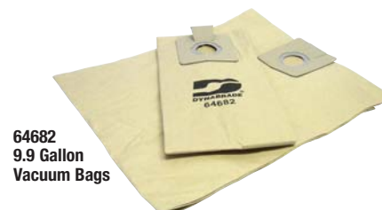
64682 9.9 Gallon Vacuum Bags