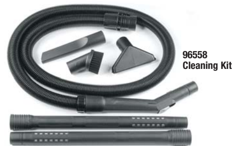
96558 Cleaning Kit