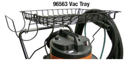
96563 Vac Tray