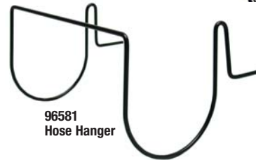
96581 Hose Hanger