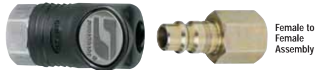
Female to Female Assembly