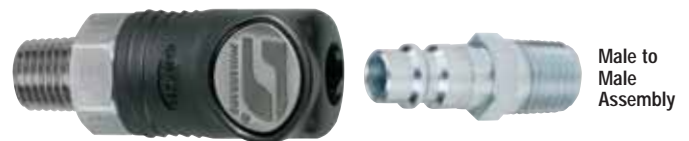
Male to Male Assembly