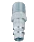
Female to Male Assembly