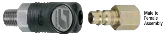
Male to Female Assembly