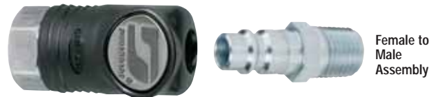
Female to Male Assembly