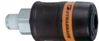
Male Safety Coupler