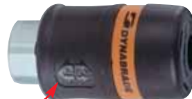
Female Safety Coupler