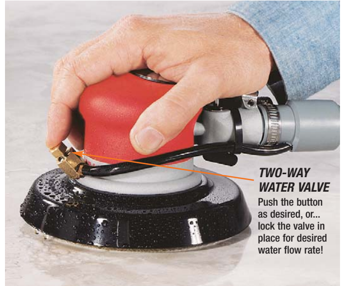
TWO-WAY WATER VALVE Push the button as desired, or... lock the valve in place for desired water flow rate!