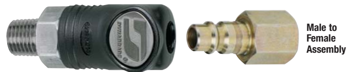
Male to Female Assembly