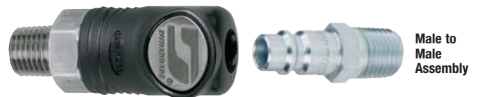
Male to Male Assembly