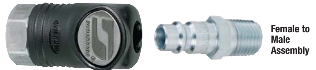
Female to Male Assembly