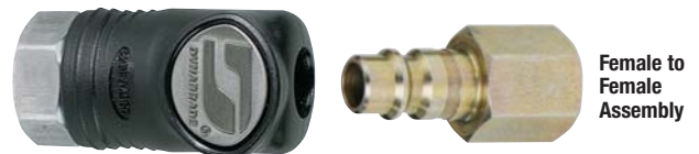
Female to Female Assembly