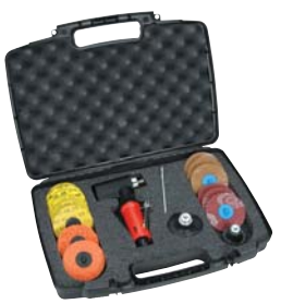
Included in the Kit: 2" & 3" Back-up Pads