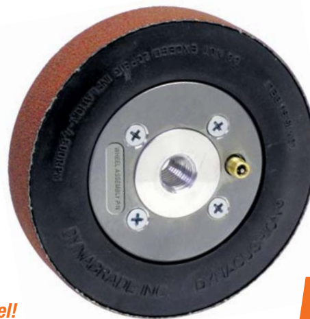
No. 92921 DynaWheel (5" diameter x 1" wide)