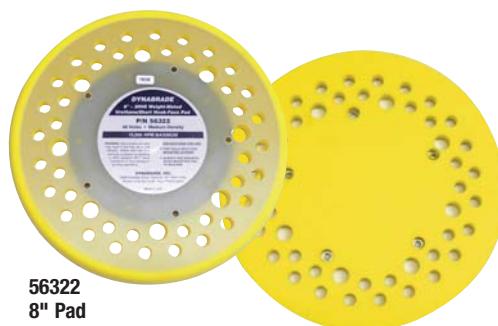
56322 8" Pad