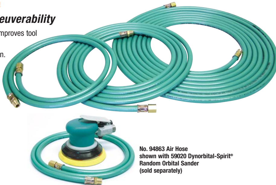
No. 94863 Air Hose shown with 59020 Dynorbital-Spirit® Random Orbital Sander (sold separately)