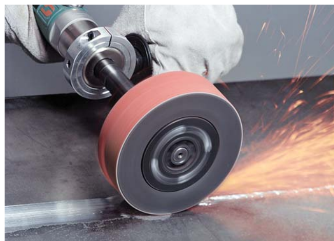
13523 Dynastraight® running optional 92868 DynaWheel for fast, efficient weld removal.