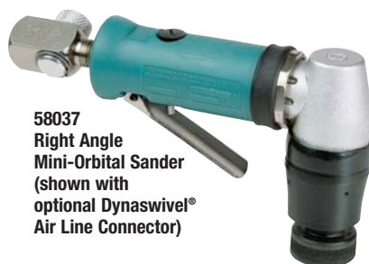
58037 Right Angle Mini-Orbital Sander (shown with optional Dynaswivel® Air Line Connector)