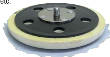
57799 Vacuum Radius Edge Pad (shown with optional Scalloped-Edge Abrasive Disc)

3M and Trizact are registered trademarks of 3M Company.