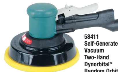
58411 Self-Generated Vacuum Two-Hand Dynorbital® Random Orbital Sander