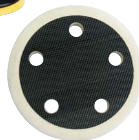
57799 Vacuum Radius Edge Pad