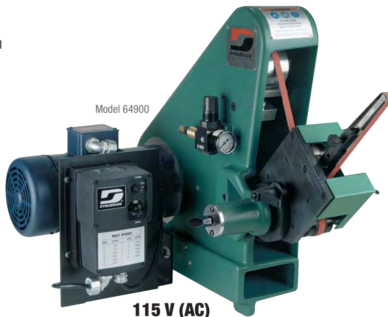
115 V (AC)