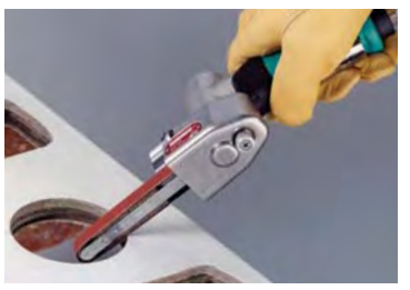
Finish rough-cut edges quickly and efficiently.