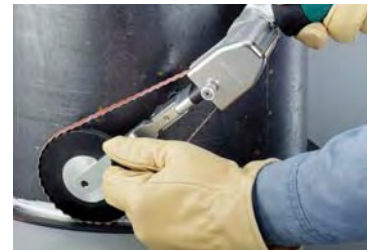
15420 tool (below) includes unique 11702 Contact Arm with hand guide.