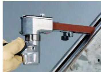
15400 Dynafire® III allows finishing and deburring in restricted areas.