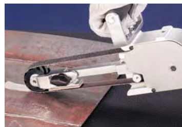
Model 11476 grinds weld seam and leaves in-line scratch pattern.