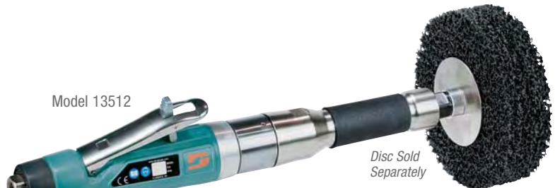
Disc Sold Separately