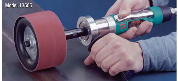
13505 Dynastraight® powers optional 94472 Dynacushion® pneumatic wheel.