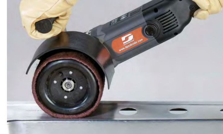
Operator moves Electric Dynisher® in easy front-to-back motion, with tool guard adjustable for optimum use. Pneumatic Wheel is optional.