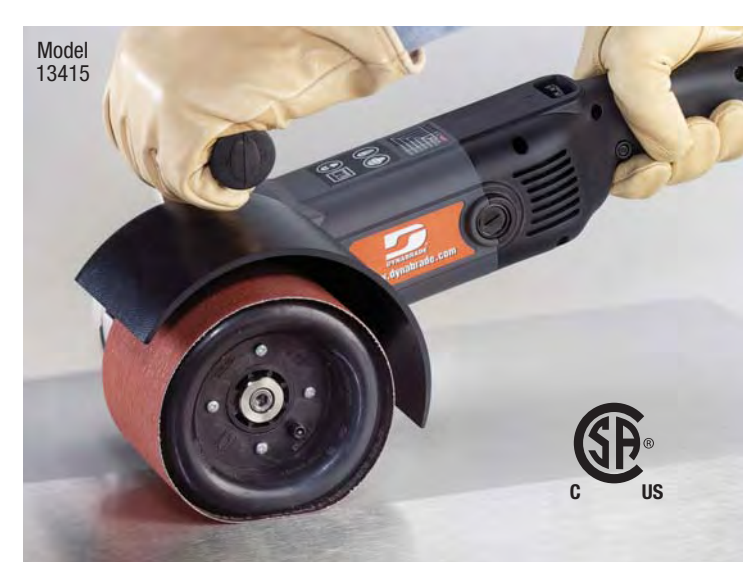
13415 Electric Dynisher® fitted with optional 92938 Dynacushion® Pneumatic Wheel and coated abrasive belt. An ideal setup for achieving in-line scratch pattern on stainless steel.