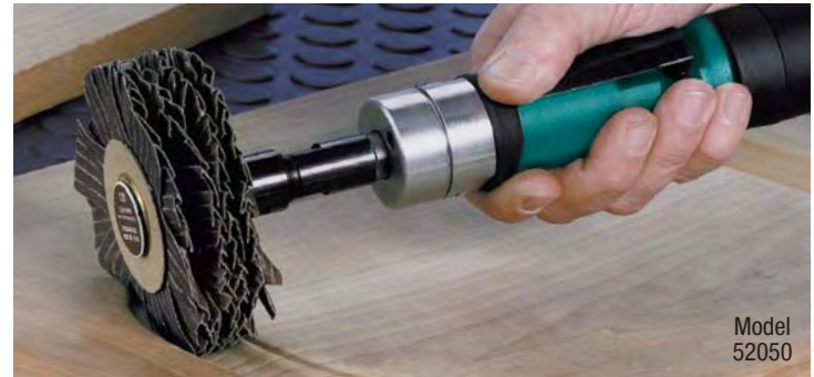
52050 Lightweight Dyninger® with optional spindle-mount stars.

Model 52052 0-3,200 RPM, .4 hp, Arbor-Mount