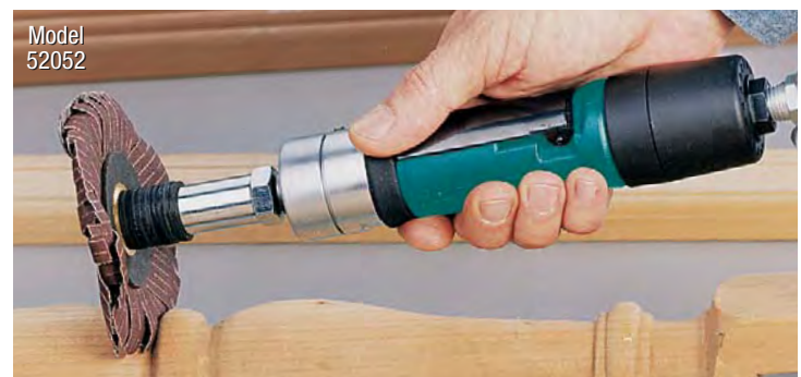
52052 Lightweight Dyninger® with single arbor-mount star attached.

NOTE: The rated RPM of a mounted sanding star is reduced when using flexible shafts. When using the flex shaft for finishing inside diameters, place the eyelet sanding star inside the workpiece, then start the tool.