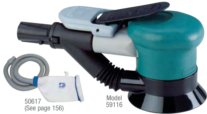
50617 (See page 156)

HiVac Dynorbital-Spirit® powers 3" diameter sanding pad.