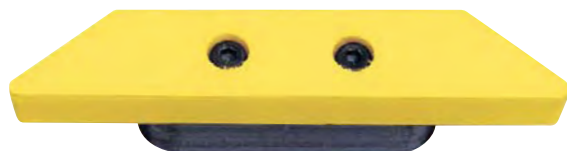
57905 Raised Panel Pad Kit