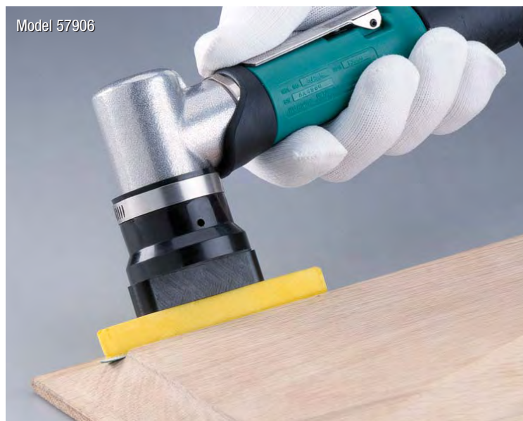
57906 Dynafine® utilizing Raised Panel Pad on a narrow curved edge.