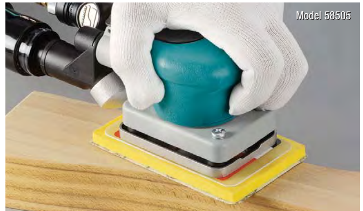
Lightweight design of Dynabug® II minimizes hand and arm fatigue.