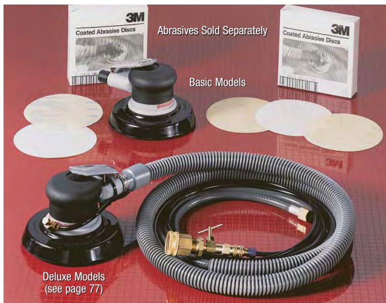
Deluxe Models (see page 77)