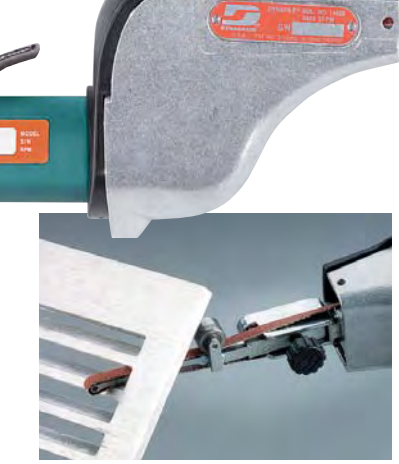
Reach into areas as small as 3/8".

Hard and soft platen pads mount onto contact arms for heavy grinding or contour polishing (see page 27).