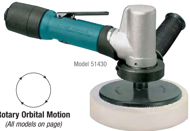
Rotary Orbital Motion (All models on page)