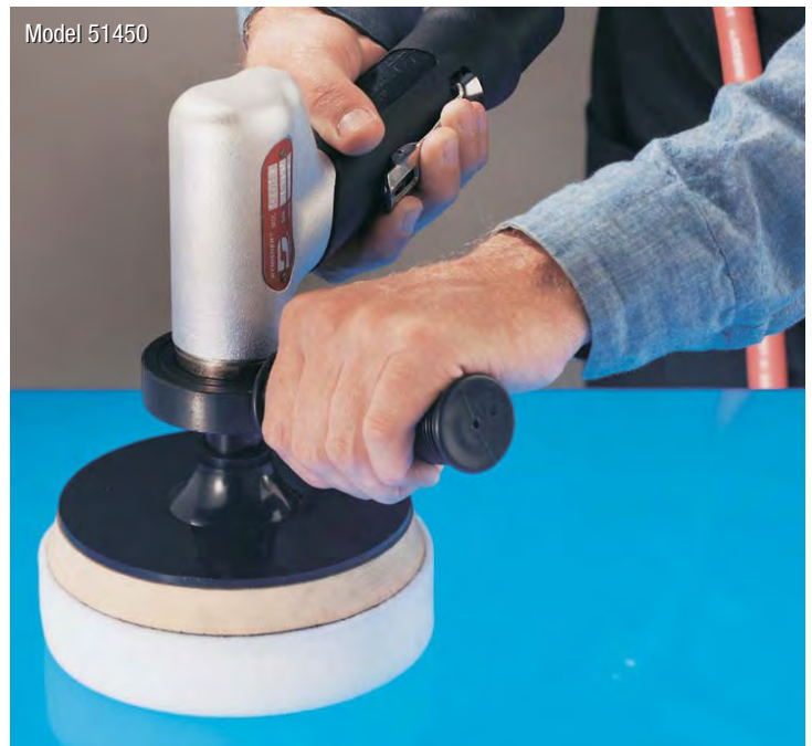
51450 Polisher shown with optional backup pad and optional polishing pad.