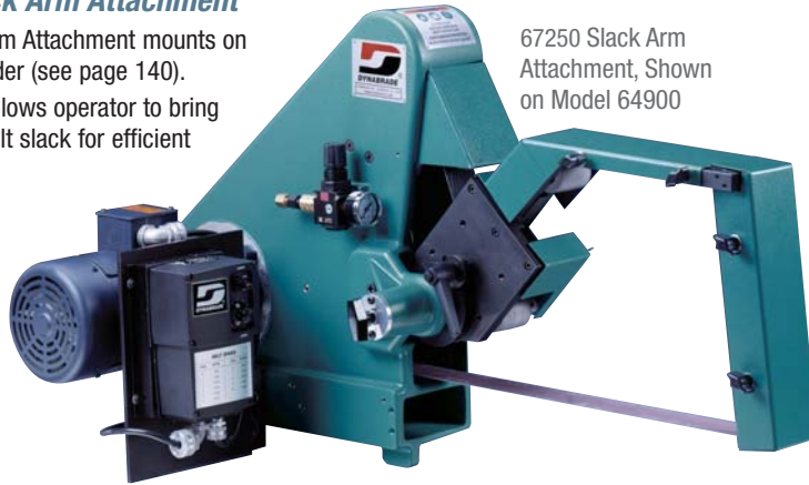
67250 Slack Arm Attachment, Shown on Model 64900