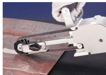
Model 11476 grinds weld seam and leaves in-line scratch pattern.