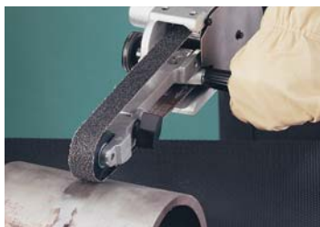
Model 11475 is ideal for grinding circumferential welds.

After attaching new abrasive belt, hold tool by the contact wheel and suspend tool vertically, to ensure that the belt is taut. Then tighten knob and flip tension lever.