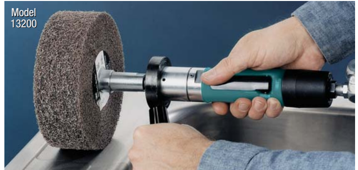
Model 13200 Dynastraight® runs optional Non-Woven Nylon Wheel (see page 218).

See page 186 for detailed arbor information.