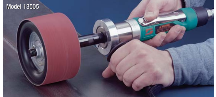
13505 Dynastraight® powers optional 94472 Dynacushion® pneumatic wheel.