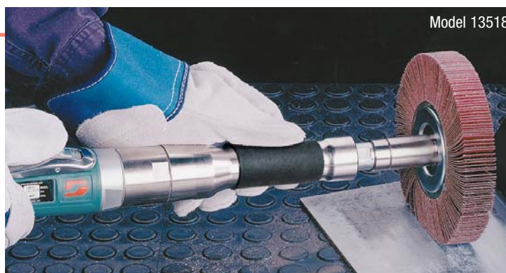
Models 13517, 13518 and 13520 are ideal for use with optional coated abrasive flap wheels (shown) and non-woven nylon wheels.