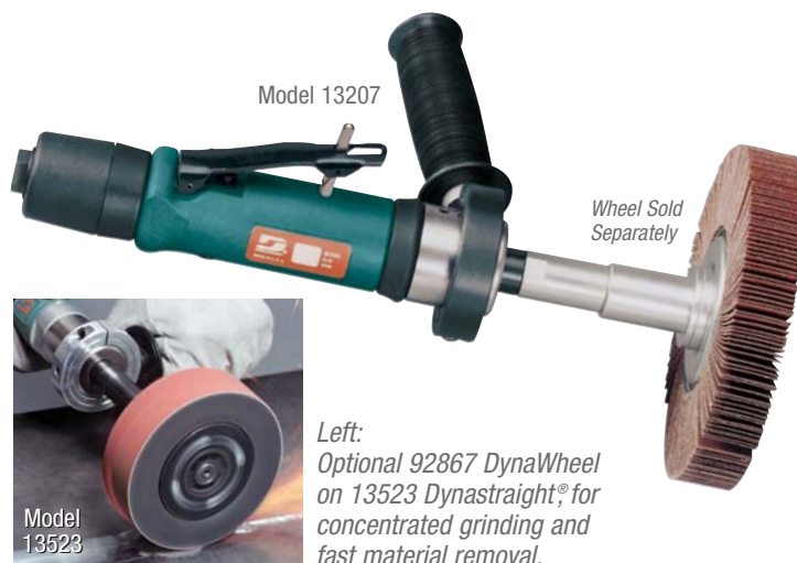
Left: Optional 92867 DynaWheel on 13523 Dynastraight® for concentrated grinding and fast material removal.