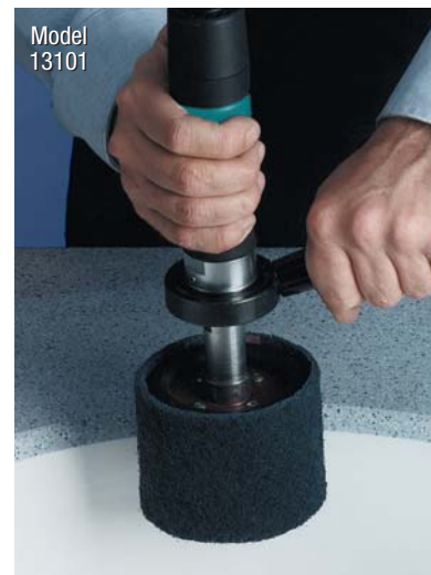
13101 Dynastraight® shown with optional 94507 Dynacushion® pneumatic wheel.