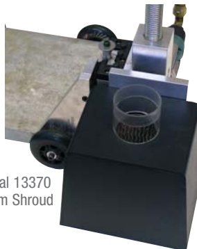
Optional 13370 Vacuum Shroud