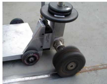
DynaRover cleaning a butt weld. (Shown with optional weight spindle.)