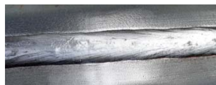
Weld seam cleaned with DynaRover.