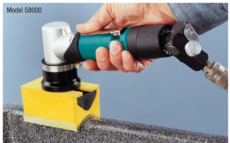
Sander powers 58024 Pad (included) for use on a radiused surface.