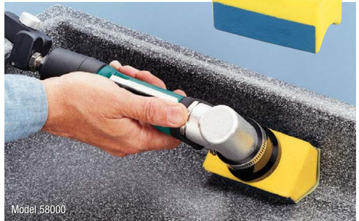
Dynafine® "Backsplash" Sander powers 58021 Sanding Pad (included), for finishing within coved backsplash.