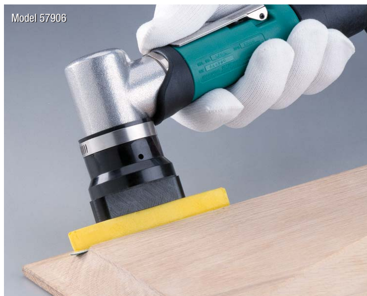
57906 Dynafine® utilizing Raised Panel Pad on a narrow curved edge.