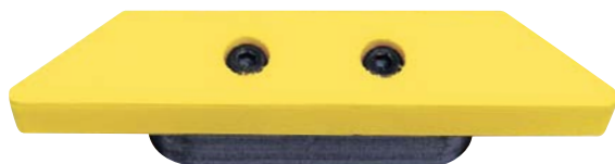
57905 Raised Panel Pad Kit