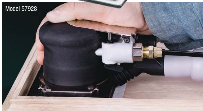
57928 Dynabug® "Model T" sands right into corners.

Dynabug® "Model T" Sander is a true OIL-FREE tool. Turbine-style, vaneless air motor needs no oil, and is virtually maintenance free.