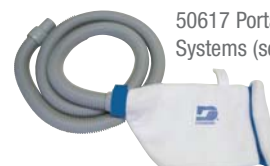
50617 Portable Dust Collection Systems (see page 156).