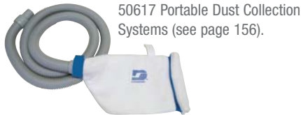
50617 Portable Dust Collection Systems (see page 156).