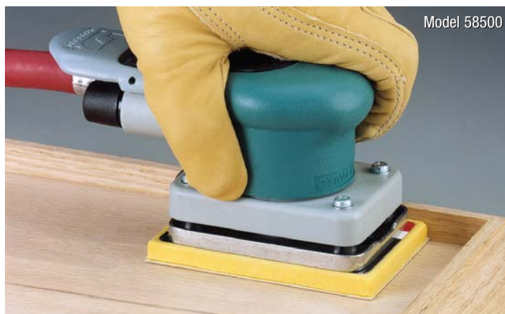
Compact size of Dynabug® II is ideal for operators with smaller hands.