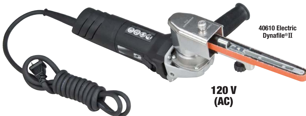
40610 Electric Dynafile® II