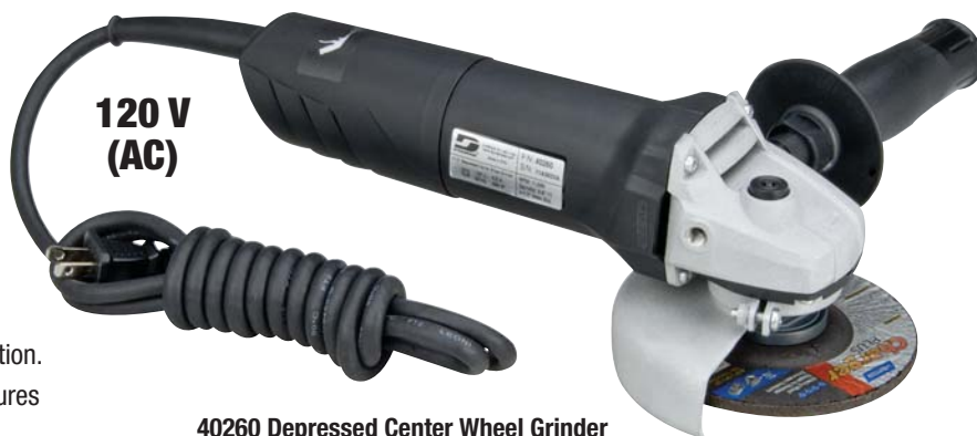
40260 Depressed Center Wheel Grinder

40260 Depressed Center Wheel Grinder offers countless grinding and material removal solutions to a wide variety of industries.