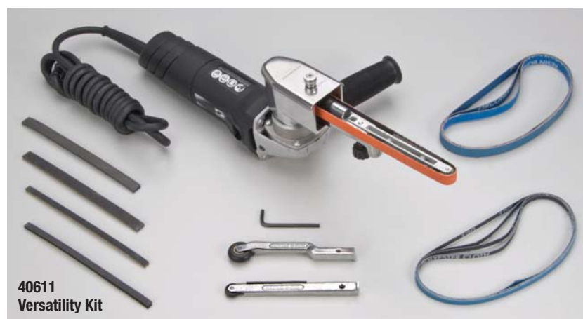
40611 Versatility Kit