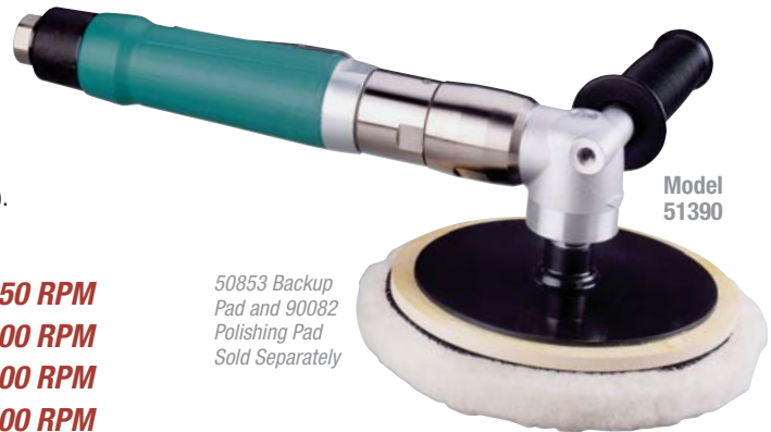
50853 Backup Pad and 90082 Polishing Pad Sold Separately