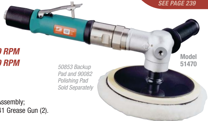
50853 Backup Pad and 90082 Polishing Pad Sold Separately

NOTE: For old-style tools 50816, 50823 and 50851, order 50797 (6" dia.) or 50798 (8" dia.) Accessory Kit.