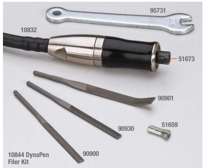
10844 DynaPen Filer Kit