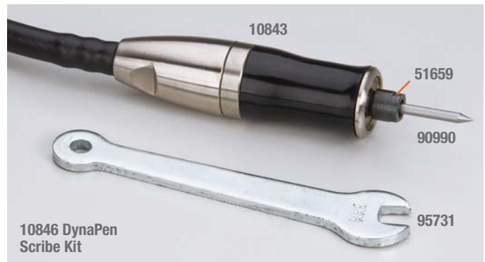
10846 DynaPen Scribe Kit

See Page 140 for DynaPen Kit with ALL Accessories!