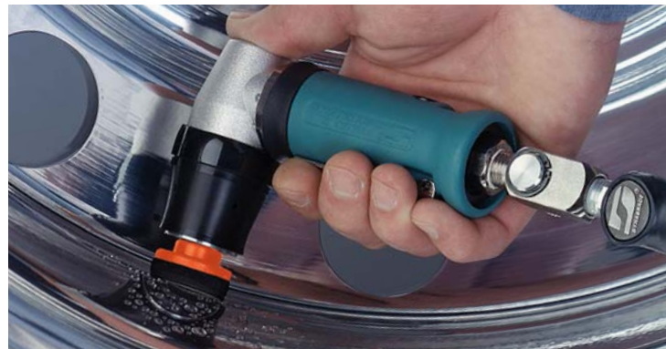
58035 Denibber shown with optional 95745 Speed Control.