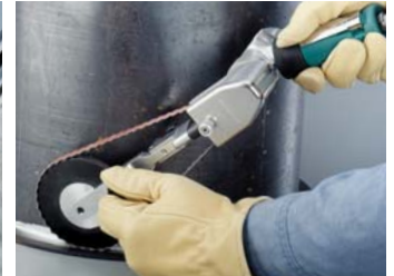
15420 tool (below) includes unique 11702 Contact Arm with hand guide.