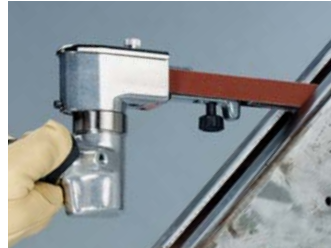
15400 Dynafire® III allows finishing and deburring in restricted areas.

FOR ABRASIVE BELTS 1/4", 1/2", 3/4", 1" wide x 18" long, (6 mm, 13 mm, 19 mm, 25 mm x 457 mm) SEE PAGE 270