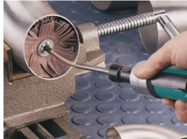
3" Eyelet Sanding Star easily enters pipe elbow using 7" long flexible mandrel.