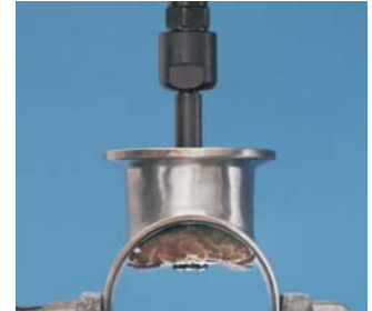
Sand and deburr inside small dia. pipe and other hard to reach areas with 3/4" – 1-1/2" stars.