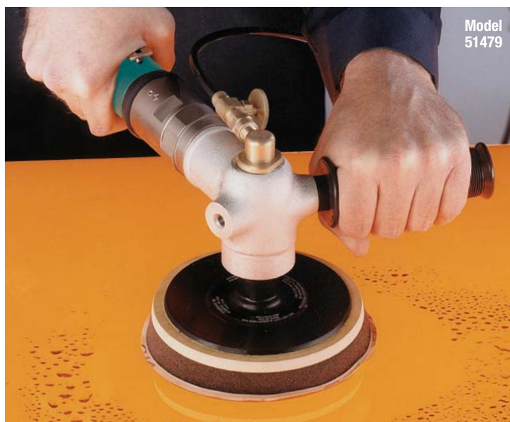
As 51479 is run, water is fed through pad center directly to work surface.