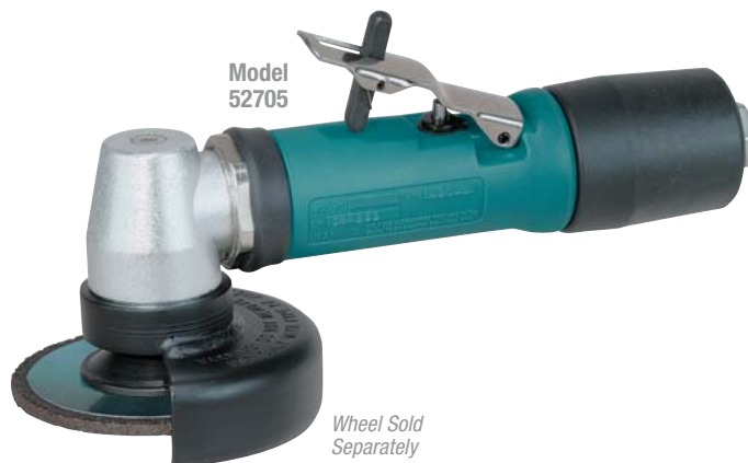
Wheel Sold Separately