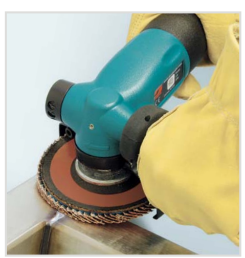
All models include powerful 1.3 hp air motor running at 12,000 or 13,500 RPM.