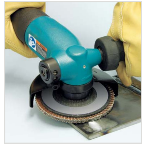
52632 Depressed Center Wheel Grinder also powers optional Abrasive Flap Discs.