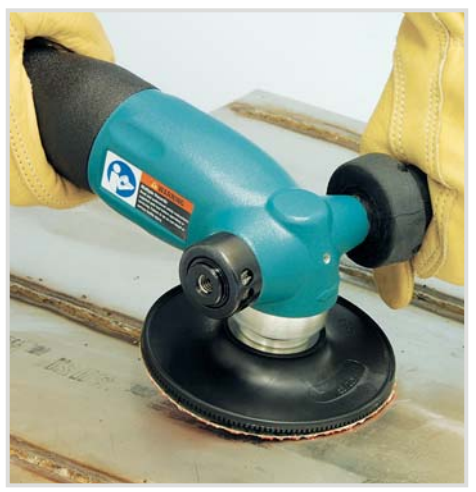
52634 Disc Sander offers efficient material removal on a variety of surfaces.