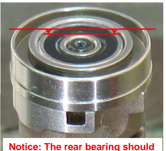
sit below the outside surface of the rear bearing plate.